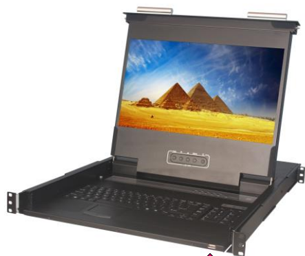
↑ (USB Port for device access)

Optimize rack space. Maximize rack monitoring